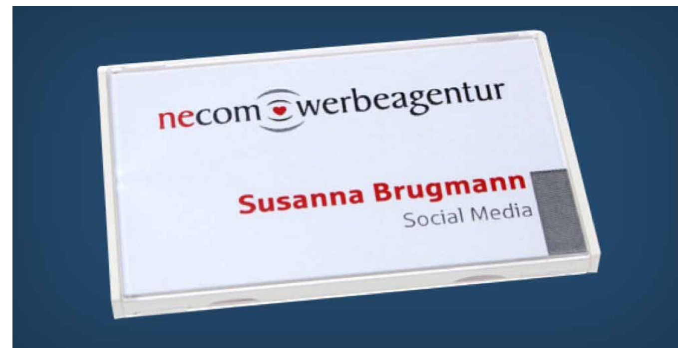
vista® classic XL

When choosing the amount of information to be displayed on your name badge, go for necessity, impact and ease of reading. The surname and company name are a must. Get your priorities right, though: what information do you want to be at the fore?